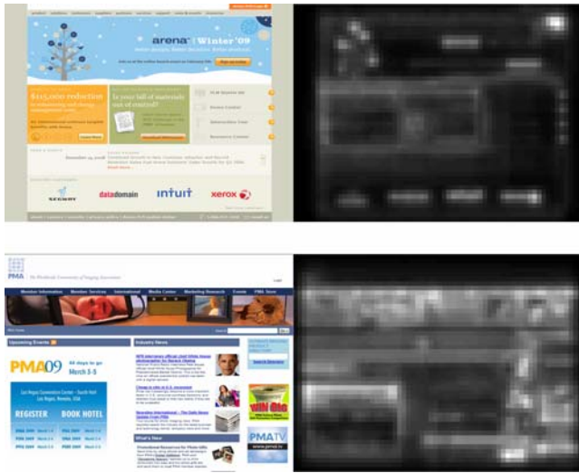
Figure 1. Two examples of web page screenshots and their corresponding saliency maps.

The experiment took approximately 15 minutes to complete.